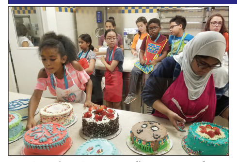
Scene from Continuing Ed's Summer Youth Culinary Program.