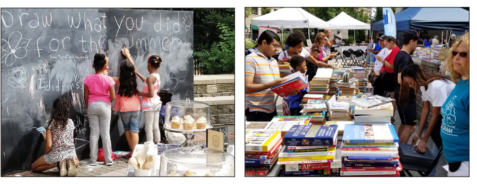
Scenes from Continuing Education's end-of-summer Book and Art Fair on Aug. 25.

Continuing Education has teamed up with Rising Tide Capital (RTC) to offer the RTC Community Business Academy at HCCC's Journal Square Campus and in Spanish at the North Hudson Campus. These 12-week courses offer hands-on training in business planning and management. Students learn business fundamentals such as