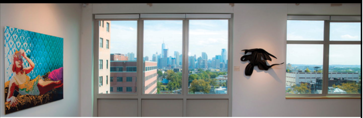
Dineen Hull Gallery

All programs are hosted at Dineen Hull Gallery unless otherwise noted. For up-to-date program information, please visit: www.hccc.edu/cultural-affairs.