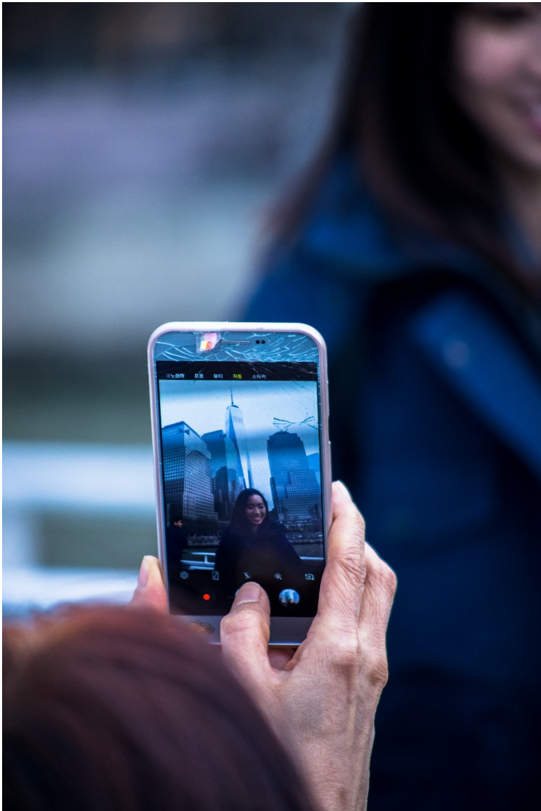
Don't Worry, Be Happy Abou Traore