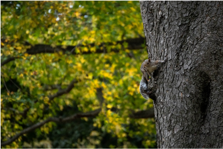
Going Nuts Shaun Crafton