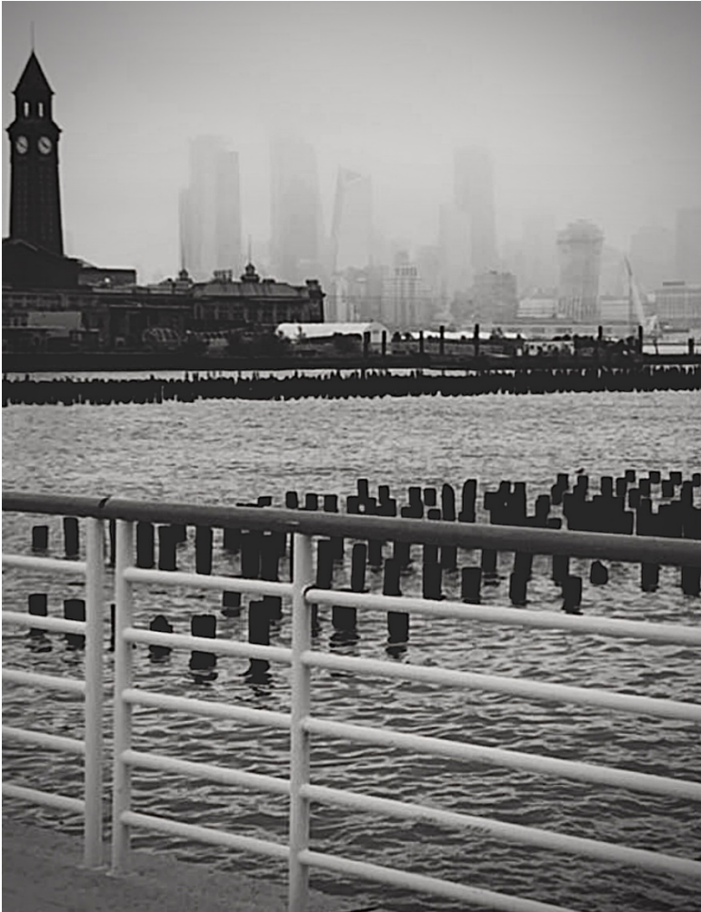
Undisturbed Kelsey Cartagena