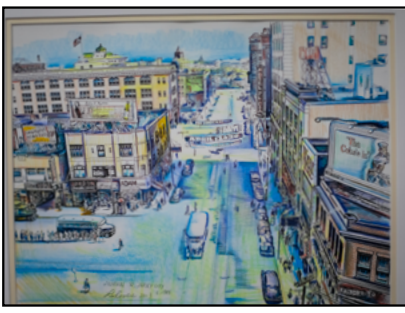
Richard La Rovere, "Journal Square, Jersey City c. 1945," hand-colored print (2013), 16.75" x 19.75" in the 2nd floor STEM computer lab.