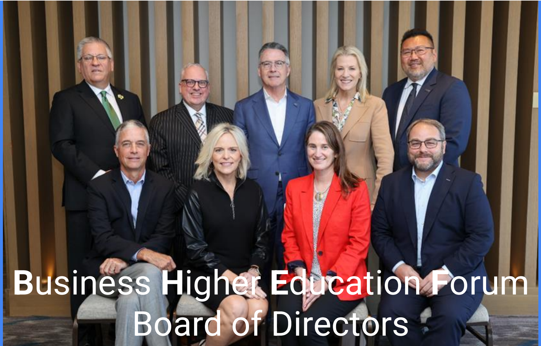
Business Higher Education Forum Board of Directors