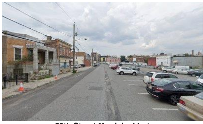
59th Street Municipal Lot

We are happy to share that as of Tuesday, September 7, 2021, full-time College employees and faculty, including adjuncts, working at the North Hudson Campus may park at the P.C. Richard & Son parking lot, located at 5349 John F. Kennedy Blvd., North Bergen, NJ 07047. Forty spaces will be made available at this location, and 35 additional spots will remain open at the 59th Street parking lot (5700 Madison Street, West New York, NJ 07093), both on a first-come, first-served basis. When using the 59th Street lot, please call Security at (201) 360-4777 to schedule a pick-up.