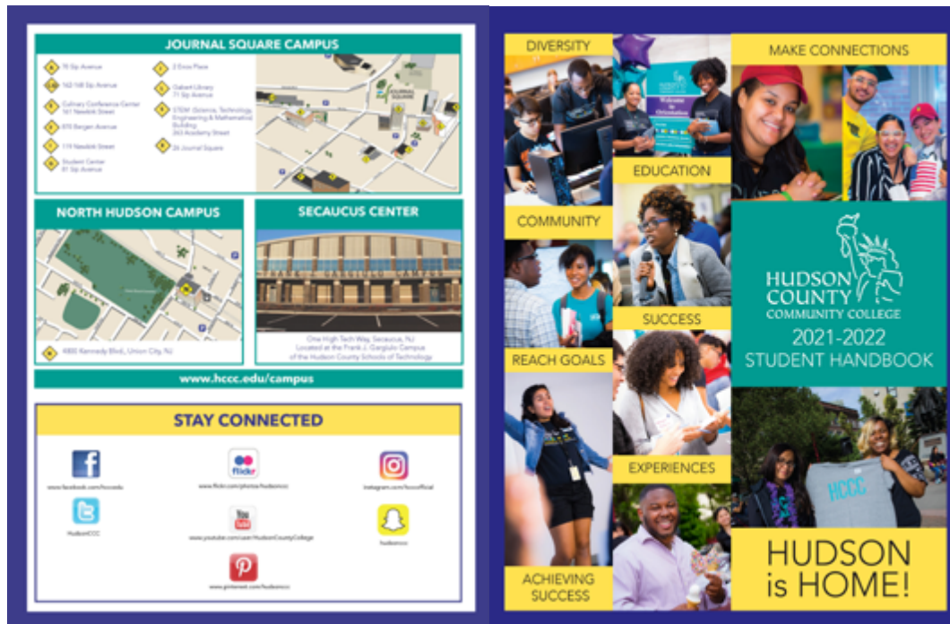
Student Handbook Cover