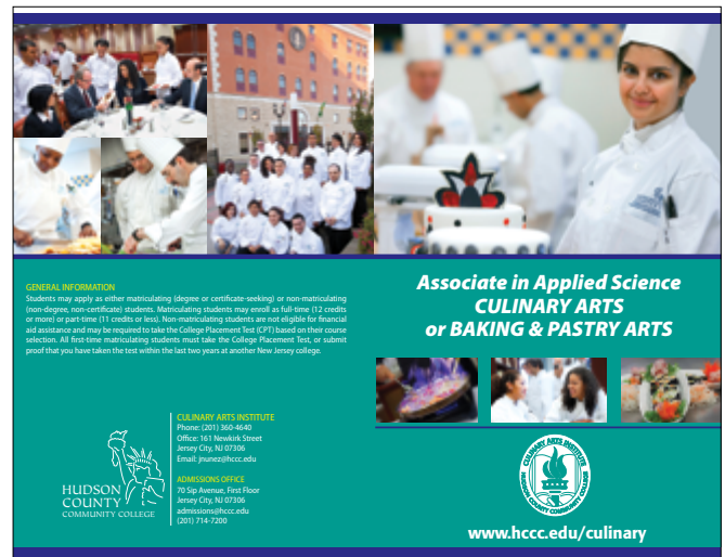
Culinary Arts Brochure