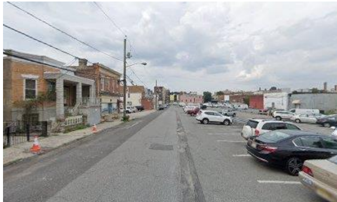
59th Street Municipal Lot

We are happy to share that as of Tuesday, September 7, 2021, full-time College employees and faculty, including adjuncts, working at the North Hudson Campus may park at the P.C. Richard & Son parking lot, located at 5349 John F. Kennedy Blvd., North Bergen, NJ 07047. Forty spaces will be made available at this location, and 35 additional spots will remain open at the 59th Street parking lot (5700 Madison Street, West New York, NJ 07093), both on a first-come, first-served basis. When using the 59th Street lot, please call Security at (201) 360-4777 to schedule a pick-up.