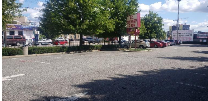
P.C. Richard & Son Lot