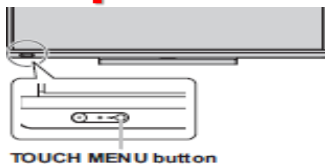
TOUCH MENU button