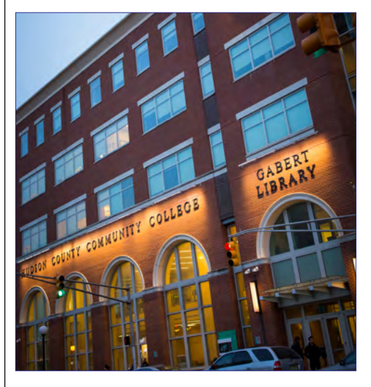
JOURNAL SQUARE CAMPUS 70 Sip Avenue Jersey City, NJ (adjacent to Journal Square PATH Station)