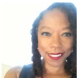
Professional Development Event Specialist