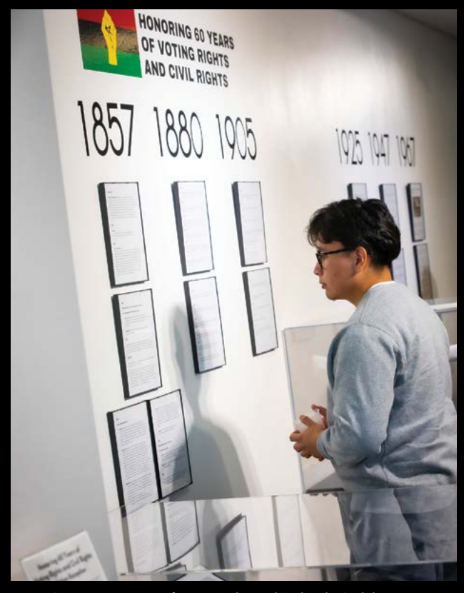
'Honoring 60 Years of Voting Rights and Civil Rights' exhibition

BENJAMIN J. DINEEN III & DENNIS C. HULL GALLERY AND THE OFFICE OF CULTURAL AFFAIRS FOR DIVERSITY, EQUITY AND INCLUSION