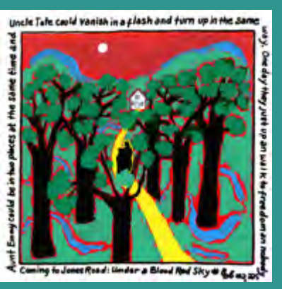
Faith Ringgold, Coming to Jones Road, Under a Blood Red Sky #8