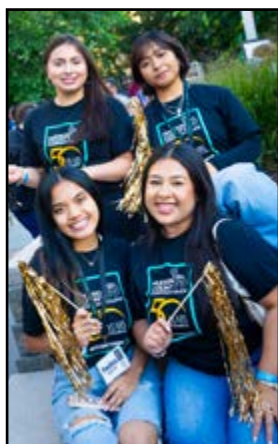
Members of the HCCC community help launch the yearlong celebration at the 50th Anniversary Kickoff event.