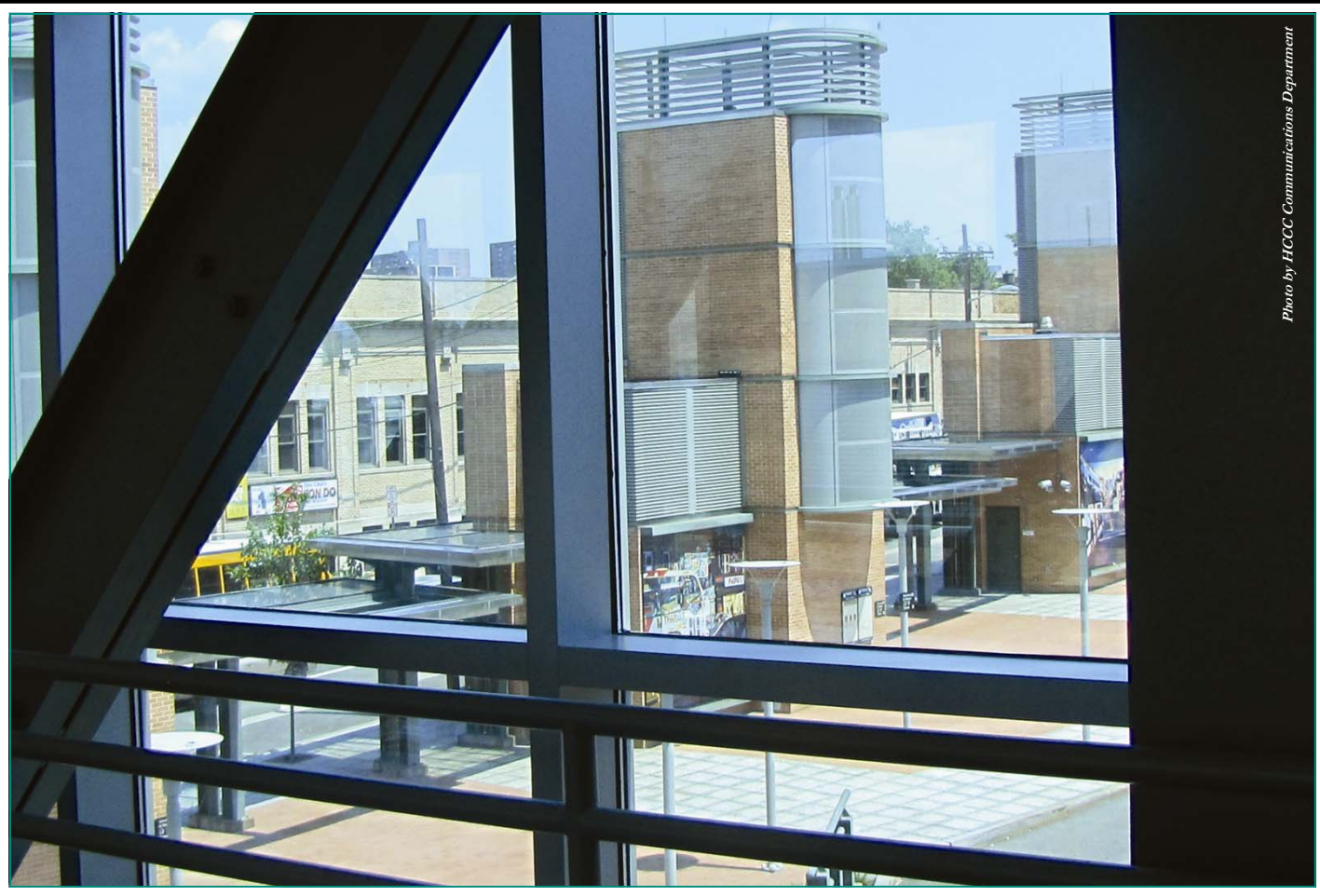
▲ INTERIOR VIEW of the pedestrian bridge connecting the North Hudson Higher Education Center to the NJ Transit Bergenline Avenue light rail station (in background). The facility will officially open at the start of fall classes on Aug. 31.