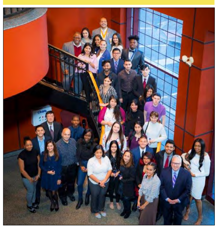
Beta Alpha Phi inductees, officers, and members with College administrators at the Fall Induction on Sunday, Nov. 4.