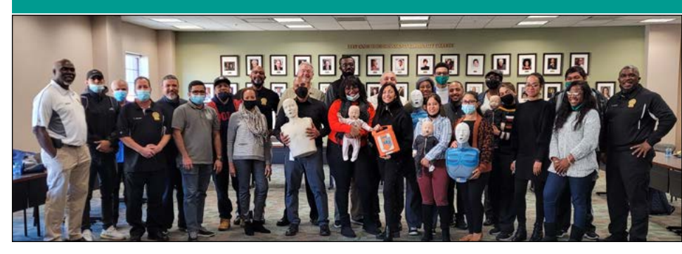
HCCC team members underwent CPR/AED training on Nov. 16.

n Tuesday, Nov. 16, the Office of Safety & Security held a certification training for Hudson County Community College participants. The CPR-AED course trains participants to provide CPR, and use an automated external defibrillator (AED) in a safe, timely, and effective manner.