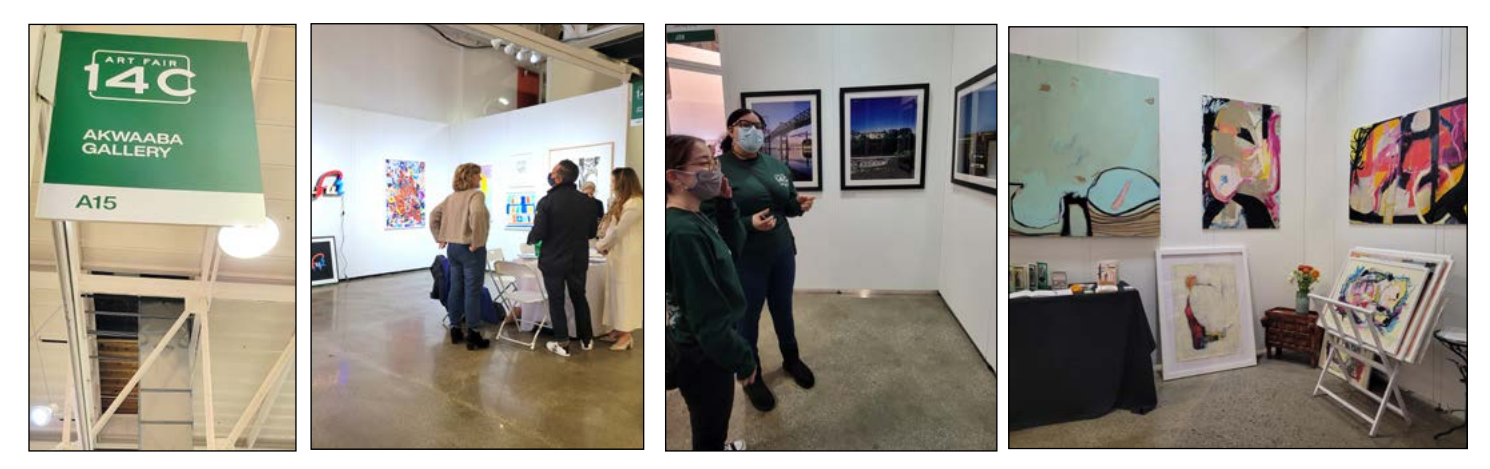
HCCC Art Department students volunteered at Art Fair 14C at Mana Contemporary in Jersey City from Nov. 12 to Nov. 14. The Fair included 75 exhibition booths, five special spaces featuring artists who use light, video and mixed media; and a Juried Show, a showcase for 40 artists from New Jersey.

Join the Department of Cultural Affairs for another month of art, interviews and music on the 6th Floor of the Gabert Library. For more information, to RSVP for programs or to visit the gallery, email: mvitale@hccc.edu