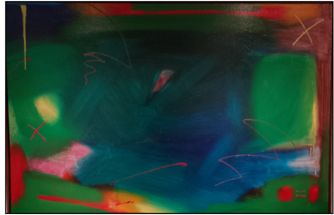
When the Foundation Art Collection visited the show, we were astonished to find out that the "Barbequed Composition" was painted by the artist in his garage. When he painted our picture, behind his actual barbecue was an abstract painting. He painted both the barbecue and the abstract painting in our picture. Please see photograph of that terrific abstract oil painting, "Color Field Composition" (1984) which is in the background of "Barbequed Composition."