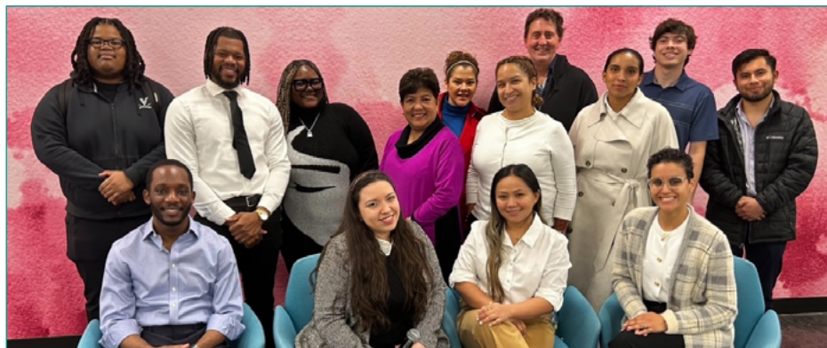
GTI staff and students featured with participants from the Oct. 30 Career Panel event.

Gateway Week concluded on a high note, delivering three days of career-focused programming which brought students, employers, and community partners together. From Oct. 28 to Oct. 30, the Gateway to Innovation (GTI) team hosted a slate of events that strengthened career readiness and expanded opportunities for participants.