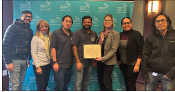
HCCC held a Hudson Is Home Employee Awards Recognition Luncheon on Nov. 19.

The Hudson Is Home (HIH) Employee Recognition Program celebrates the dedication, innovation, and collaborative spirit of the HCCC community. The nomination period ran from Oct. 1 to Oct. 31, followed by a committee review.