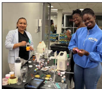
HCCC's American Chemical Society (ACS) chapter successfully held an active schedule of activities during the Fall term, including events and excursions during National Chemistry Week and attendance at the 2025 Frances S. Sterrett Environmental Chemistry Symposium.