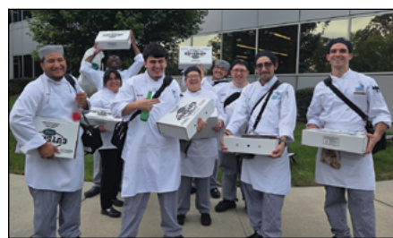
On left: Students dining at and touring The Capital Grille Restaurant in Paramus. On right: The students’ hard work at the Driscoll’s Food Show is rewarded – with hamburger patties from a reputable local butcher!

T he Culinary Arts Institute (CAI) kicked off the 2026 academic year with a series of exciting events showcasing student talent, creativity, and community engagement.