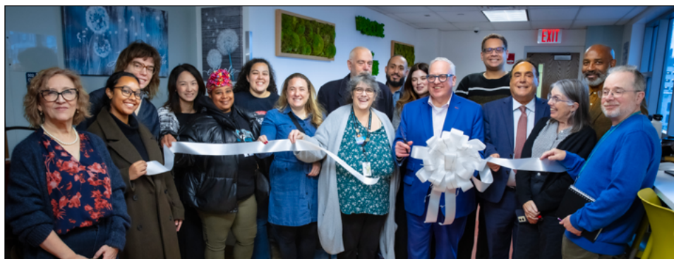
HCCC held a ribbon-cutting ceremony of "The Calm Zone" at the College's North Hudson Campus. The space, located on the fifth floor, is a place to rest, relax, and reset for staff, students, and faculty.

Earlier this year, Insight Into Academia magazine honored HCCC with the 2025