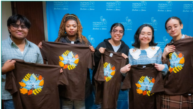
The Office of Student Life and Leadership hosted Friendsgiving Feasts at the North Hudson Campus on Wednesday, Nov. 19 and at the Culinary Conference Center on Thursday, Nov. 20.