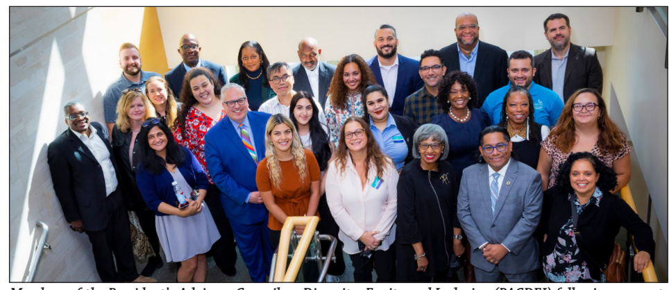
Members of the President's Advisory Council on Diversity, Equity and Inclusion (PACDEI) following a recent meeting.

n Sunday, Oct. 24, Hudson County Community College's Environmental Club organized a visit to the American Museum of Natural History on New York City's Upper West Side. The Museum is the largest natural history museum in the world with a mission commensurately monumental in scope. The entire museum spans four city blocks and consists of some 25 interconnected buildings.