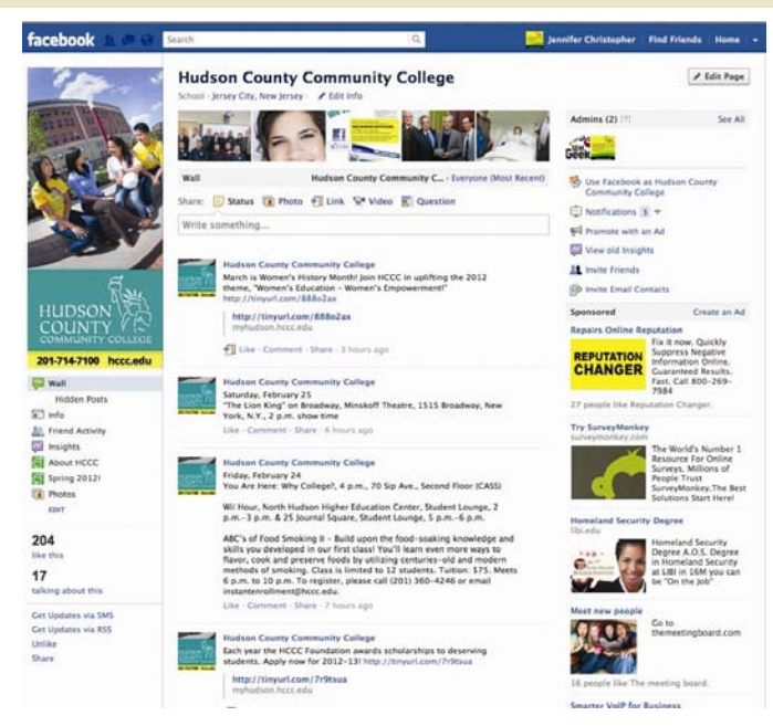
▲ SCREEN SHOT of the Hudson County Community College Facebook fan page.