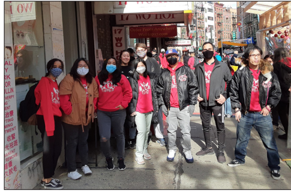
Beta Alpha Phi Chapter volunteered at the Lunar New Year Parade in New York City on Saturday, Feb. 12. Volunteers included members of the Information Technology Services (ITS) College Libraries teams.

When initiating an online application, students must take and pass an eligibility quiz. Visit https://www.ptk.org/scholarships for more information.