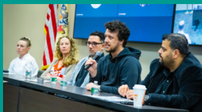
Beyond the Lectern: HCCC Professors Share Insights on Education