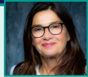
In Celebration of Women's History Month

the School of Business, Culinary Arts, and Hospitality Management presents