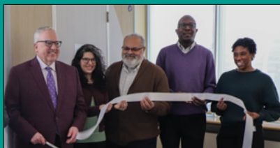
HCCC Opens Lactation Pods