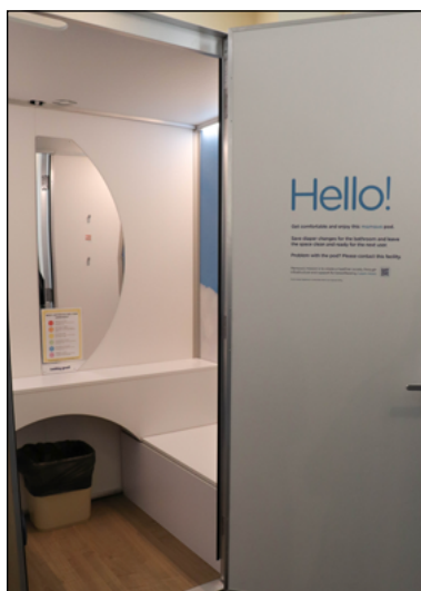
Lactation pod at the Gabert Library (71 Sip Avenue, First Floor).