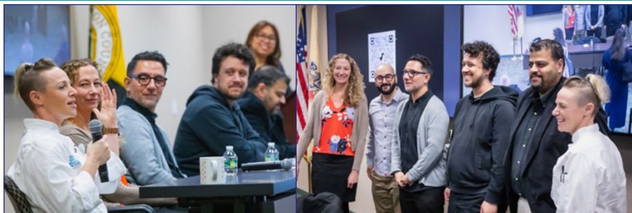
Faculty panelists in the Feb. 5 "Beyond the Lectern: Insights from HCCC Professors" event.

On Wednesday, Feb. 5, the Culinary Conference Center's Scott Ring Room buzzed with thought-provoking dialogue as Hudson County Community College (HCCC) hosted "Beyond the Lectern: Insights from HCCC Professors." This engaging panel discussion brought together esteemed faculty members to share their perspectives on the triumphs, challenges, and evolving landscape of education.