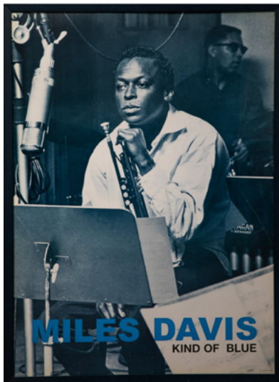
Artist Unknown, Miles Davis "Kind of Blue", ca. 1990s, Offset Lithograph, 56.5" x 41.75." Look for student research on this work—part of the Jersey City Arts & Culture Trust Fund grant—coming soon to the website and a nearby placard!