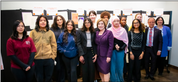
Cultural Affairs held the fourth annual "Words Worth" poetry festival on April 10 and 11.