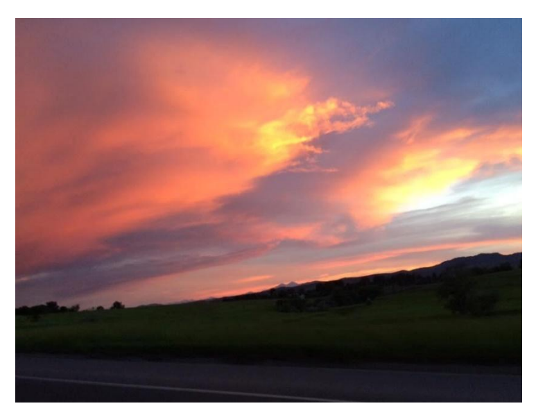
Untitled Angela Seibert