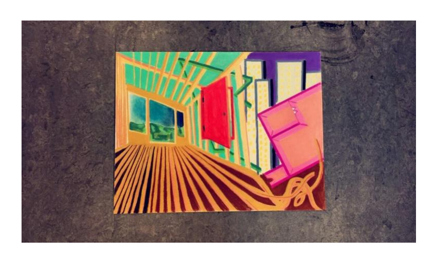
Untitled Melany Mayorga