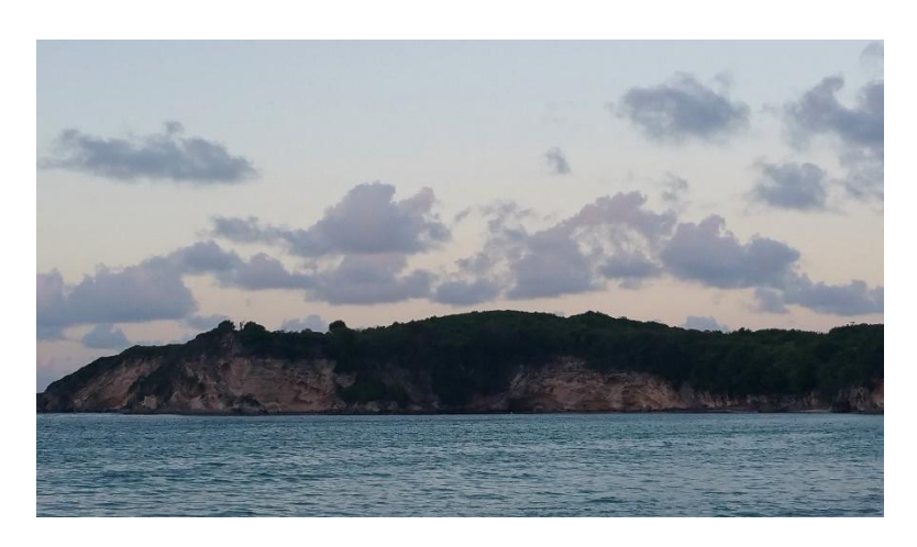
Macao Beach in Dominican Republic Griselda Paulino