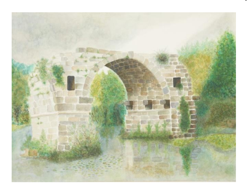
Untitled Yashminie Singh