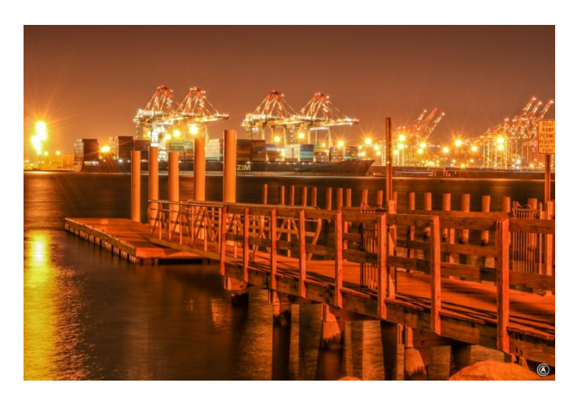
Untitled Abou Traore